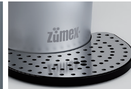
Removable drip tray.