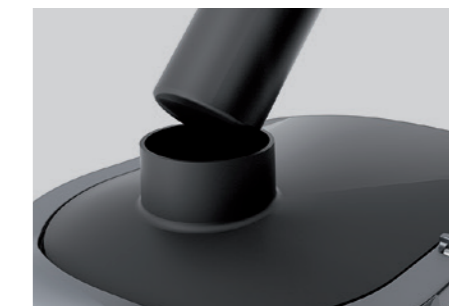
Broad inlet mouth (75 mm).