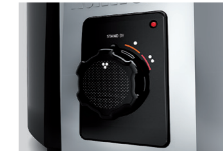
2 position selector: Soft Fruit. Hard vegetables.

For the first time a rear power switch has been incorporated to allow STAND BY status, thereby saving energy. Its intelligent selector, unique in the market, adapts the power to the type of fruit or vegetable.